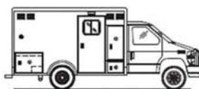
Std. Curb Side Option