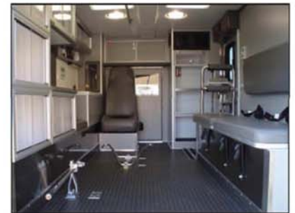
(shown w/additional options)